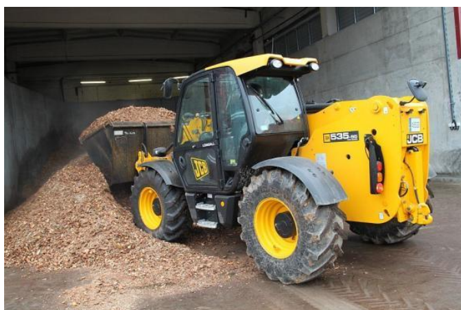
Biomass storage for the new Garliava biomass boiler (6.5 MW th incl. condensing economizer)

Bioenergy production and use is among the priorities of several key EU funding programmes, including the national and regional Operational Programmes under the Cohesion Fund and the European Regional Development Fund, and the rural development programmes under the European Agricultural Fund for Rural Development. However, in many of these national and regional programmes, sustainability principles and criteria for bioenergy have been included only to a very limited extent, if not marginally so far. This is in contrast to international, EU and national policy and business initiatives targeting the sustainable production and use of biomass for energy production, and the ongoing debate at the EU and member state level about the sustainability risks and opportunities of increased bioenergy use.