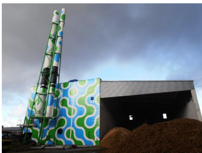
GECO investment biomass boiler-house in Kaunas City (20 MW th incl. condensing economizer)

European Regional Development Fund, transnational co-operation programmes under the European Territorial Co-operation Objective (particularly the Baltic Sea Region and Central Europe Programme) and programmes under the European Agricultural Fund for Rural Development (EAFRD).